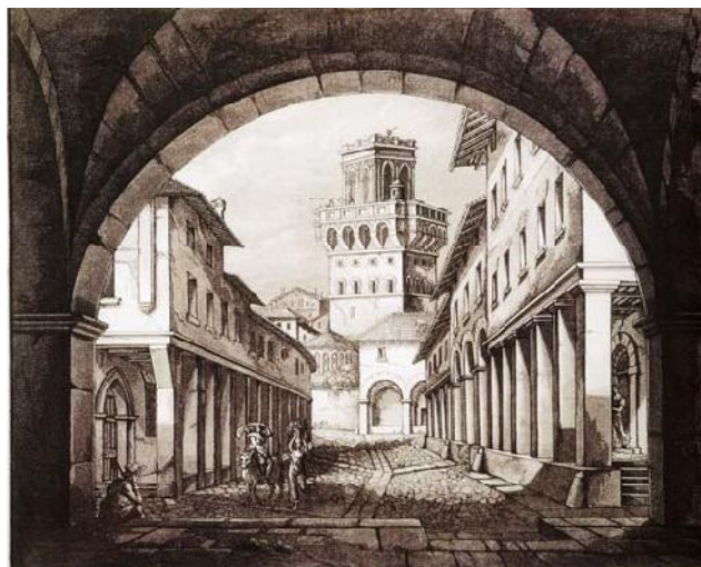
Figure 2. Bologna, S. Sigismondo Alley (University Quarter). Engraving by Antonio Basoli (1774–1848).