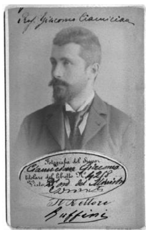
Figure 1. The young Giacomo Ciamician (approximately 1890).

investigations while the century ended, the WW1 took place, the peace returned, and so on. During the last few years of his busy life he finally devoted himself to promoting the building of new premises for the classrooms and chemistry laboratories of the University. However, even though he took active part in their design and witnessed the start of the work, he was unfortunately not fated to see its completion.